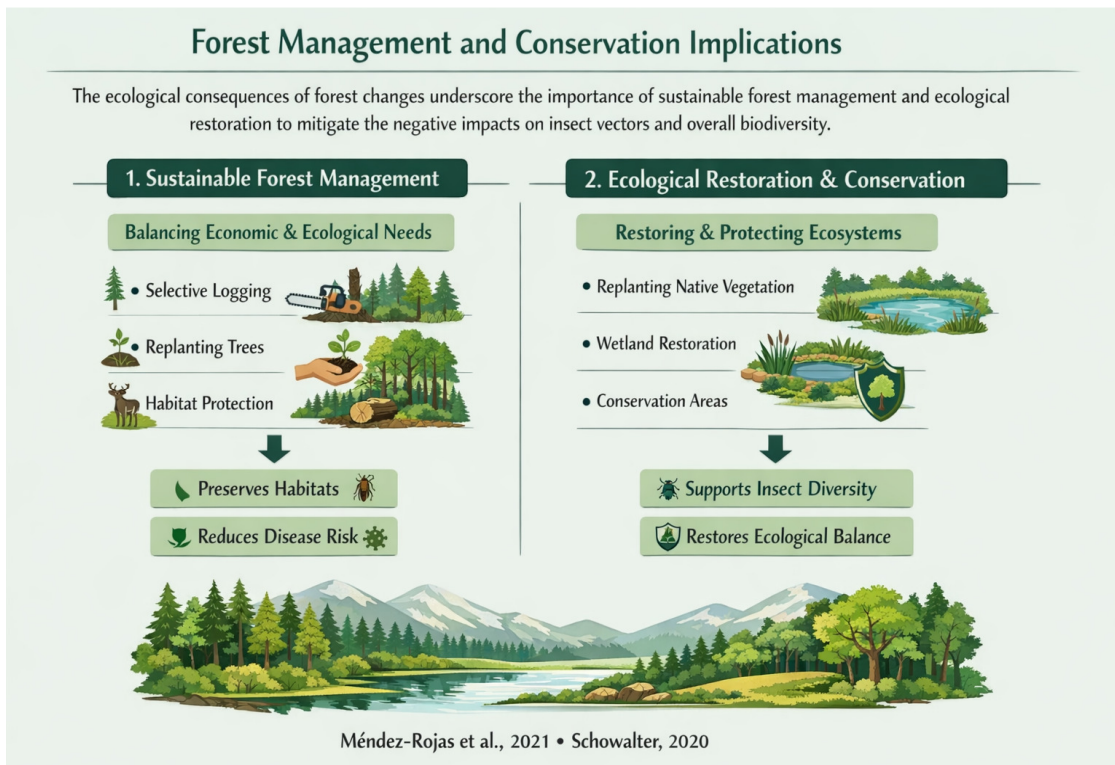
Figure 1: Forest Management and Conservation Implications:

environment, and forests, with their unique microclimates, provide vital ecosystems for the breeding, feeding, and sheltering of these insects. Forests provide abundant resources, such as humid conditions, shade, standing water, and vegetation, which are essential for mosquito reproduction and other vector life stages (Fellous Séguret, 2022). However, as human activities alter forests through deforestation, fragmentation, and urbanization, the abundance, distribution, and behavior of insect vectors are drastically affected. These ecological changes can result in vectors migrating to human habitats, thus increasing the likelihood of disease transmission in previously unaffected areas. This section explores the relationship between insect vectors and forests, the impact of forest change on vector populations, and specific case studies on the ecological dynamics of major vectors like Anopheles mosquitoes, Ixodes ticks, and Aedes mosquitoes. Understanding these interactions is critical for predicting disease transmission patterns and developing effective strategies for controlling vector-borne diseases in the face of global environmental changes.