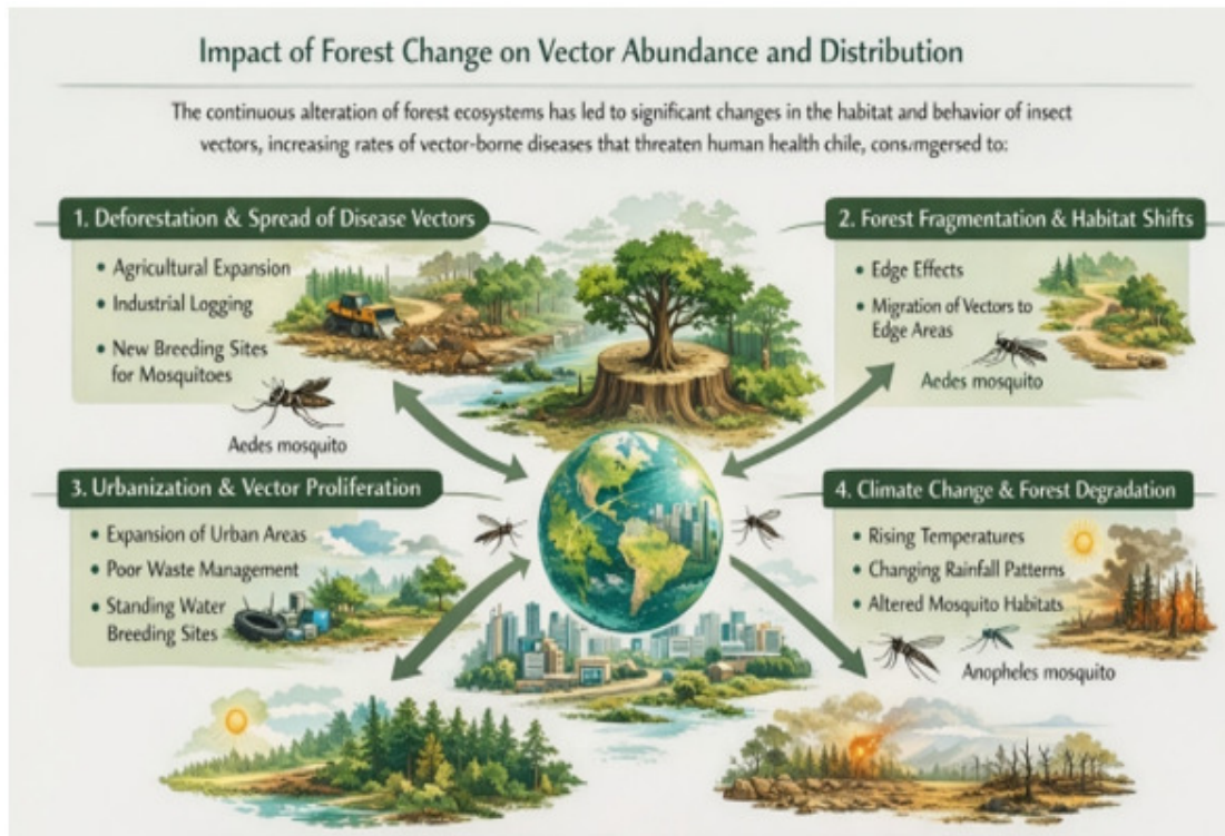
Figure 2: Impact of Forest Change on Vector Abundance and Distribution: Source: Gely et al. , 2020

The destruction of natural predators of ticks, such as birds and small mammals, further exacerbates this issue, contributing to the spread of Lyme disease in urban areas. Lyme disease, transmitted by Ixodes ticks, is another example of a disease that has seen an increase in incidence due to forest changes. Ixodes ticks, which are the primary vectors of Lyme disease, thrive in forested and fragmented environments. As forests are cleared for agriculture or urban development, the ticks are forced into the edges of forests or even urban areas, bringing them into closer contact with human populations (Zhao et al. , 2025). The increased presence of deer, a key host for these ticks, in suburban and fragmented forest areas has further contributed to the spread of Lyme disease. The changing landscape due to forest loss allows for the expansion of tick populations, leading to higher rates of Lyme disease in affected regions.